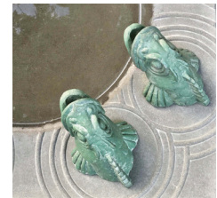
Birdbath fish detail.