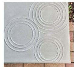
Bench seat detail.